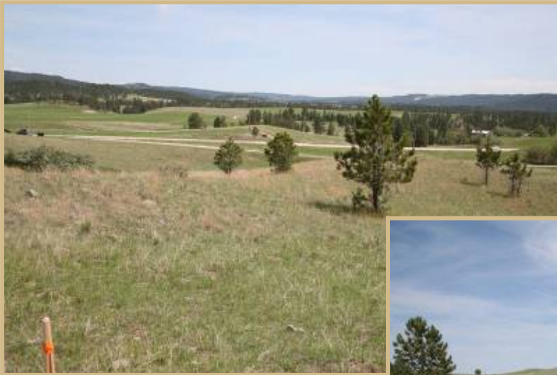
NEIMAN RENDEZVOUS RIDGE SUB. LOT TWO A 15.61 acres—$150,000