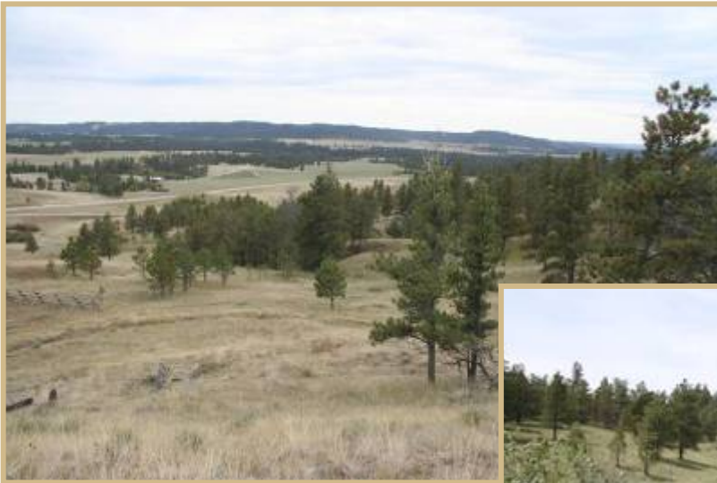
NEIMAN RENDEZVOUS RIDGE SUB. LOT THREE 13 acres—$130,000